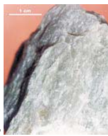
Figure 1. A, Chrysotile asbestos, a member of the serpentine group of minerals. B, Antigorite and lizardite, nonasbestiform serpentine minerals. C, Tremolite asbestos, a member of the amphibole group. D, Tremolite having a nonasbestiform habit. Serpentine and amphibole minerals can have fibrous or nonfibrous structures; the fibrous type is called asbestos.